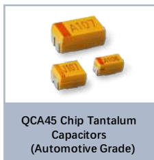
QCA45 Chip Tantalum Capacitors (Automotive Grade)