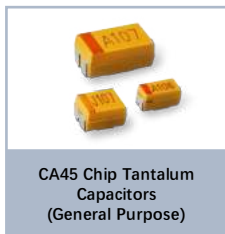
CA45 Chip Tantalum Capacitors (General Purpose)