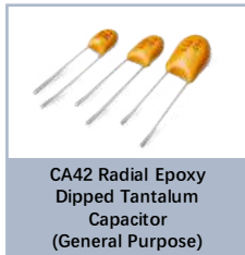
CA42 Radial Epoxy Dipped Tantalum Capacitor (General Purpose)