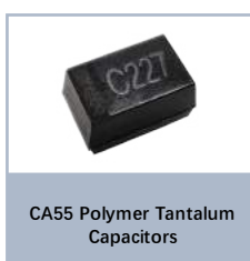
CA55 Polymer Tantalum Capacitors