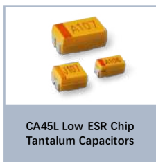
CA45L Low ESR Chip Tantalum Capacitors