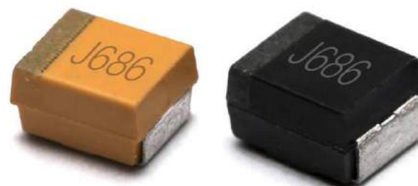
Yellow and black color are available